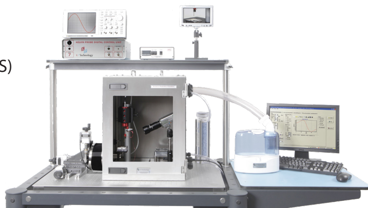
Relative humidity system model: RHC020 with 3-axis scanning