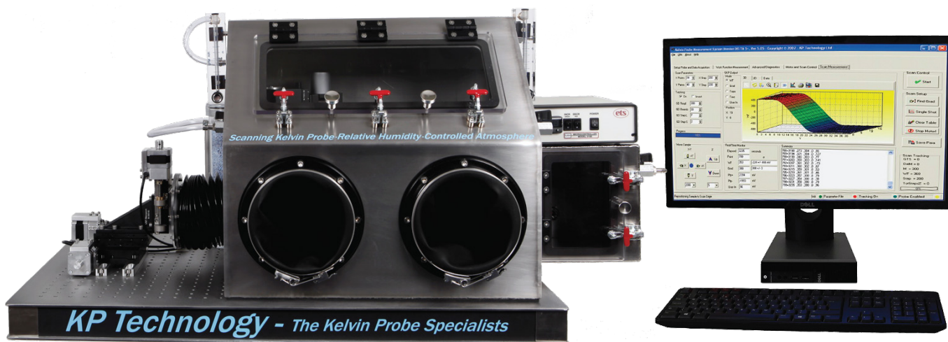
Relative humidity system model: RHC040 with 3-axis scanning capabilities